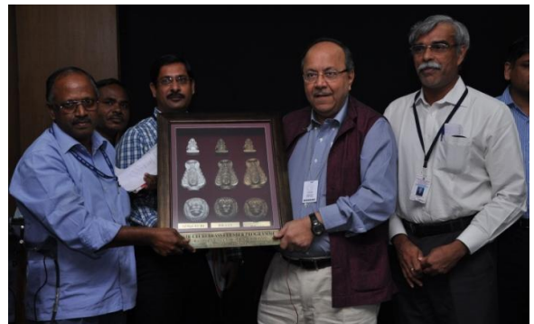
Team Members with DG, CSIR (Sep 2012)