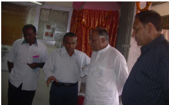
Demonstration at Moradabad (Nov 2012)