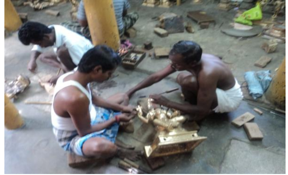
Director, CSIR-CECRI interacting with brassware industry people at Kumbakonam, Tamil Nadu